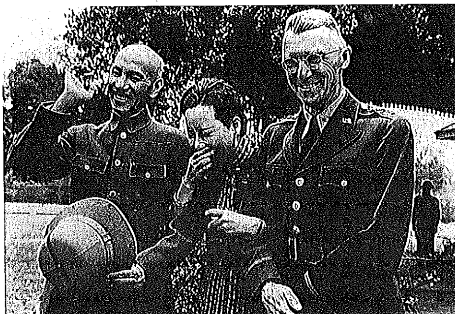
Generalissimo and Madame Chiang Kai-shek with Lieutenant General Joseph W. Stilwell, Commanding General, China Expeditionary Forces, on the day following a Japanese bombing attack [the Doolittle Raid], Maymyo, Burma (Myanmar) 1942.

(Guomindang) forces, as his chief of staff. Stilwell had been selected by Army Chief of Staff General George Marshall and Secretary of War Henry Stinson because of his expertise on China. Chiang respected Stilwell because of his ability to speak Chinese, and Stilwell's expertise in China was a major asset that allowed him to get involved quickly with operations in the CBI, when he arrived in February 1942.