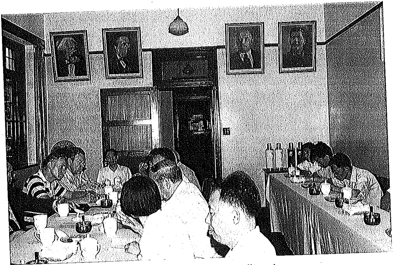
Portraits of Communist Party founders hanging on the back wall remain an imposing presence in the District court house. Putuo District of Shanghai.