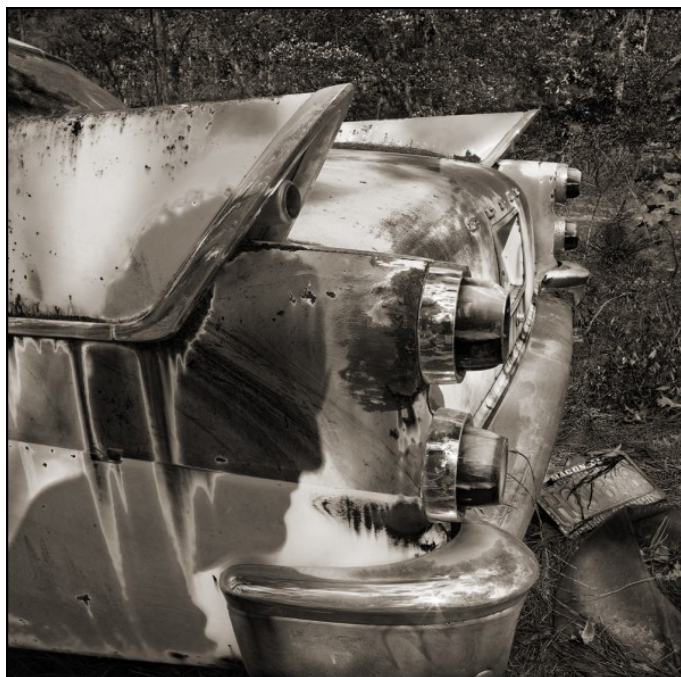
"Self-Portrait with '57 Dodge." Series: Bethlehem Road, Image Size: 14x14, Date Shot: 2005.