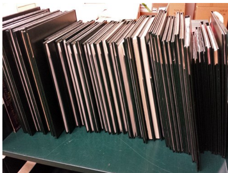
Scores after binding.