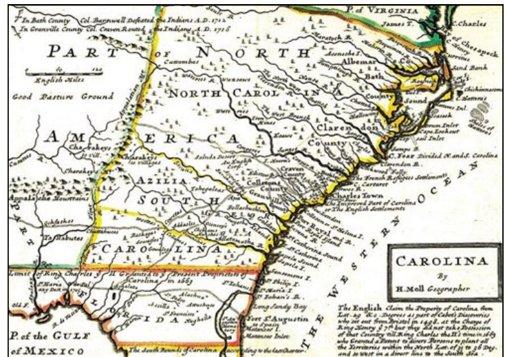
The Carolina or "Azilia" Map by Herman Moll, 1729 shows the first concept of Georgia, known then as Azilia.