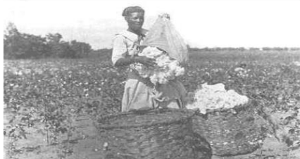
Enslaved Woman picking cotton in Savannah Georgia

In 1858, The "Wanderer," Slave Ship was the last American slave ship in history. Al though the journey of the Wanderer ship did not make many stops, one of the most prominent stops on its vessel was Savannah, Georgia submerged in between Jekyll Island and St. Simons Island. Under records, The Wanderer only took two voyages. Each of the voyages have shown no records of specific numbers on how many females and/or males embarked the ship. It is estimated around 400 slaves were brought on the ship. During this time in Georgia gender was becoming more necessary in slave markets. Previously both genders tend to work in the field until it became the new "normal," in the to have males outside doing labor and females doing housework.