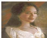
Top Picture- One of the infamous fancy girls