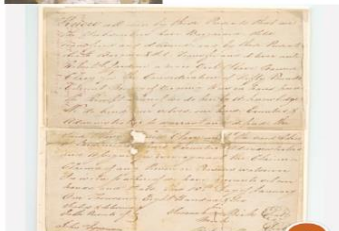
Bottom picture- Bill of sale of Clary