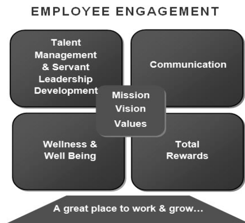
Figure 1. Key Drivers of Employee Engagement.

As indicated above, the Clinic's new people strategy was designed to address several of the key drivers of engagement, as illustrated in Figure 1, and each of the components of this strategy would prove to be critical to improving engagement. But given the critical relationship between leadership and engagement, one of the most important of the Clinic's engagement initiatives has arguably been the on-going effort to implement the concept of Servant Leadership.