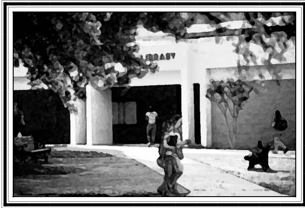
Spring arrives at Simon Schwob Memorial Library

Non-Profit Organization US Postage paid Permit No. 10 Columbus, GA 31908